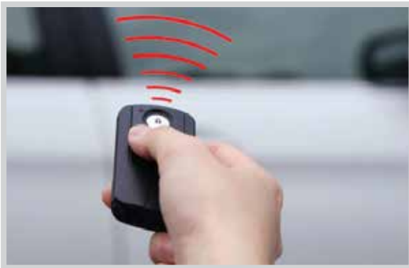
Optional Keyless Remote System unlocks cap rear door with your truck's remote key