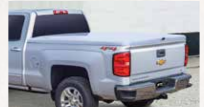
Tonneau Covers: page 11