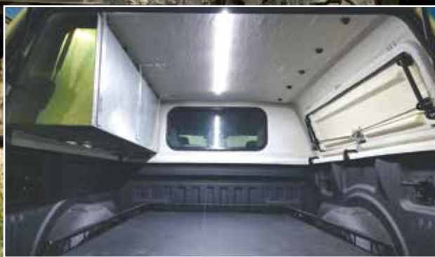
LED strip lighting illuminates your work area for full visibility and access night or day