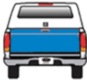
Standard Half Gate with Radius Window Add security screen