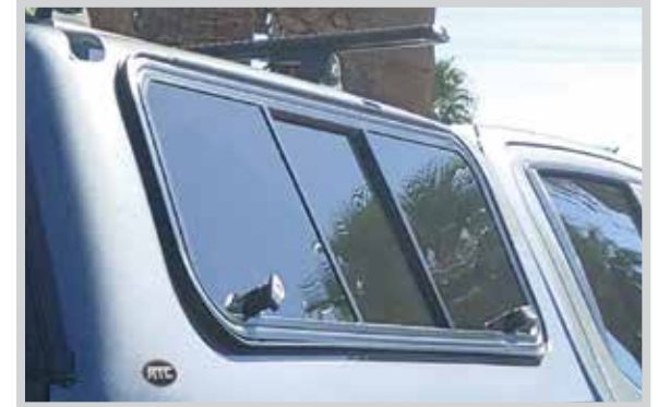
Optional side Window with Slider provides ventilation without opening the entire Window