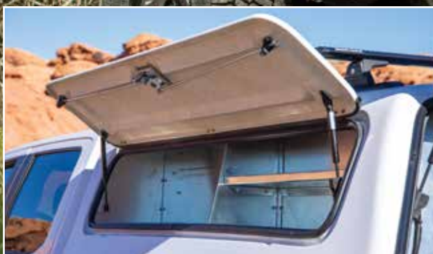
3 point locking side doors, shown with galvanized steel tool boxes

Truck at left Shown with optional roof rack system