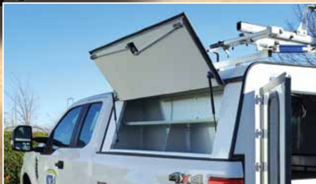
Mutiple toolbox options available