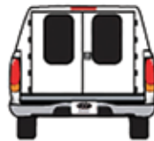
Double Doors with Radius Windows Add security screen