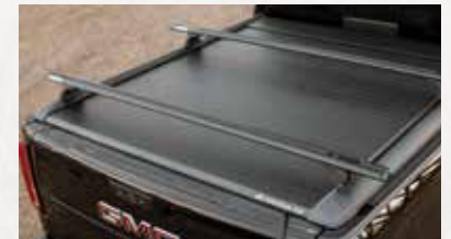
Mountain Top Retractable Bed Covers: pages 12-13