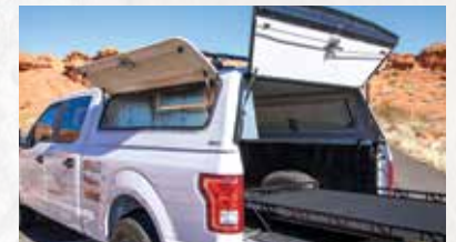
Commercial Truck Caps: pages 14-15 & 17-19