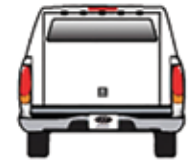
Hatch Back with Radius Window Add security screen