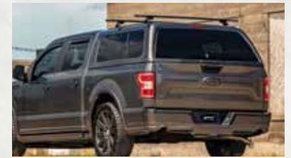
Truck Caps: pages 4-10