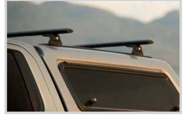
Optional Roof Rack Systems for extra carrying capacity