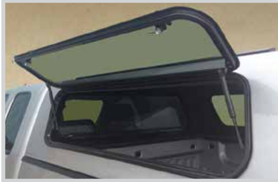
Optional side Window provides added access to cap interior