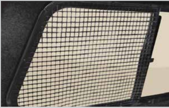
Optional Pet Screen allows fresh air ventilation and keeps pets inside