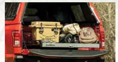
LoadMaster Bed Systems: page 16