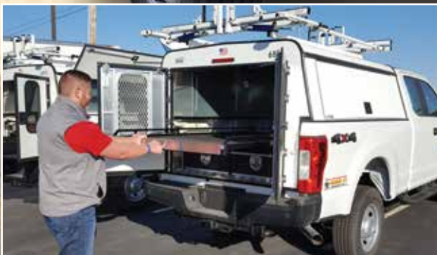
Full visibility and optimized ergonomics

Choose from a variety of options to easily spec out the ProSeries cap you need for your business. See pages 18 and 19.