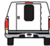
Single Walk-In with Radius Windows Add security screen