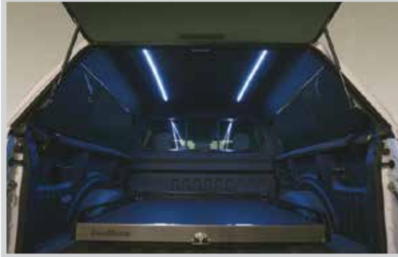
Light up the interior of your cap with optional LED Strip Lights