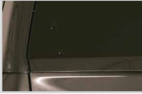
Optional Painted Rear Door Extender to match truck and cap color