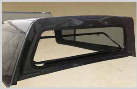
Optional cap tilt down Hinged Front Window allows access to wash back window of truck