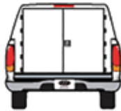
Double Doors Solid no window